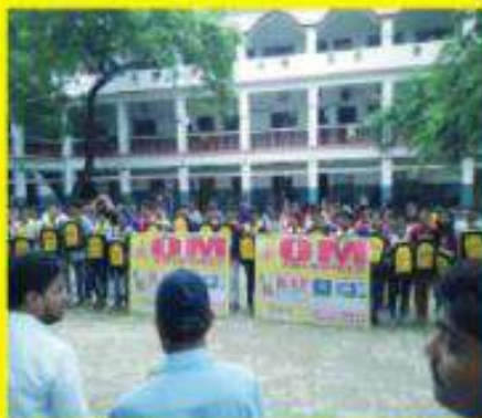
Defining Importance of Reasoning in T.D. Girls Inter College, Gomti Nagar.