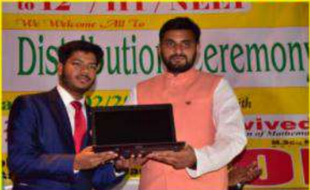
1st Prize Winner Awarded a Laptop