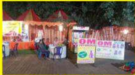
Awareness Through Outdoor Event in HAL Campus