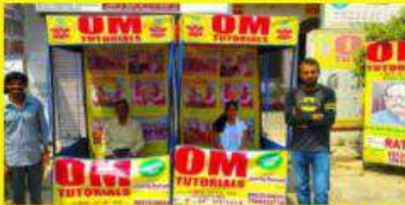
Awareness Through Canopy