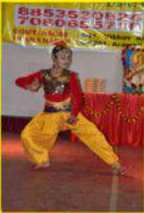
Our Students Performing Cultural Programme