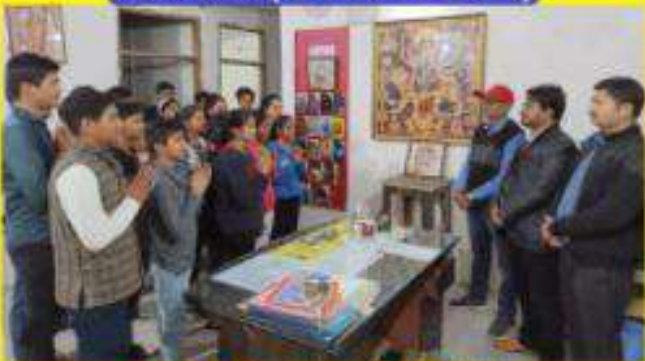
Students Displaying their Gratitude towards Teachers with Memento.