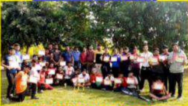
Team of OM TUTORIALS after Playing Cricket Match with Students.