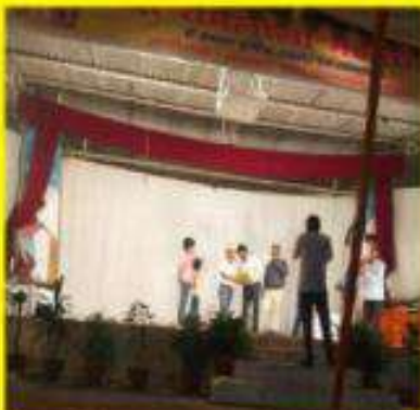
Being Awarded by Ram Leela Society in HAL Campus for Social Cause.