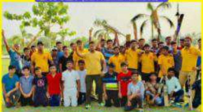
Team of OM TUTORIALS Enjoying their Win After O.P.L.