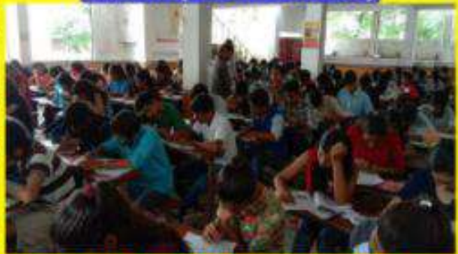
Students During RAT (Reasoning Aptitude Test)